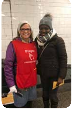
New York City Trip .....