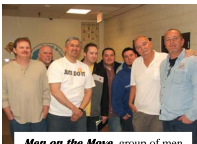
Men on the Move , group of men from near Salt Lake City, UT

We get to do this again in Colorado in October and again here next March. If you can make it, please come! And if we are too far, let us know. Maybe we could schedule a conference a little closer to your home.