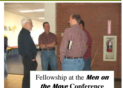
Fellowship at the Men on the Move Conference