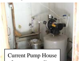
Current Pump House for raw water line.

engineering part of the process. Please pray that the Lord will help us communicate well with each other and that we will find out what we need to know to step forward with the water system development.