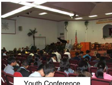
Youth Conference preaching

I was thinking about our desire to be a blessing to churches in Arizona and wondering how we could do more to encourage teenagers to stay active living for the Lord. God then put in my heart the idea for a contest which we have now named the West Branch Arizona Youth Challenge.