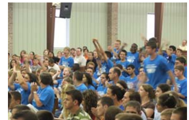
What youth group will win the West Branch Arizona Youth Challenge?

The challenge promotes the types of things we believe fundamental