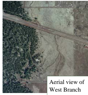
Aerial view of West Branch

Next, we will be asking the Lord to provide