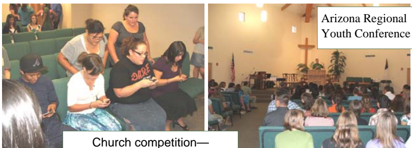
'Speed Texting" Championship