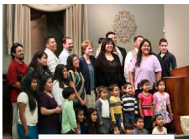
Some of the families who attended the Marriage & the Home Conference