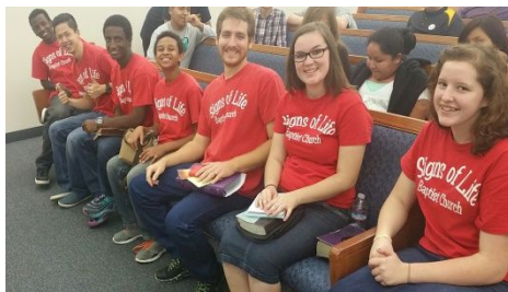
Signs of Life Baptist Church deaf teens and counselors attending our 2017 Youth Conference

The Bill Rice Ranch was founded largely for the purpose of reaching the deaf with the gospel. Because of this, West Branch has had many deaf camps and outreaches throughout the years. Lately, we have not been able to do as much as we would like. That is about to change.