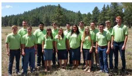
2017 Summer Staff

More than half our summer staff team is secured. We still need three counselors (one lady, two men), two Ranch Hands, and one program staff member. Know anyone interested?