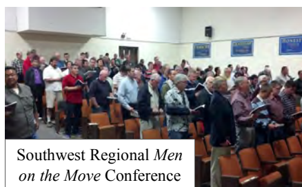
Southwest Regional Men on the Move Conference Williams, AZ

churches. The preaching, spirit, and fellowship were tremendous. At the end of this week, we will hold our Ladies Spring Getaway in Flagstaff, Arizona, where we expect to be joined by over