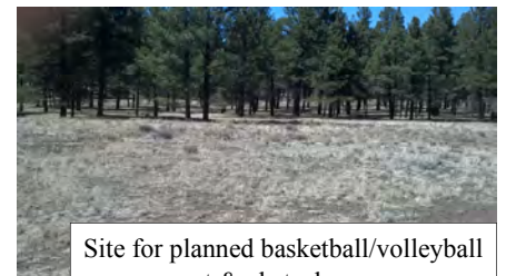
Site for planned basketball/volleyball court & obstacle course

Most importantly, we are working with the local churches involved to get the kids to camp. Part of the “trial run” is the special pricing plan we are offering two Native American churches. As it is, they will be raising funds to bring children from these reservations. We are asking the Lord to supplement the discount we are giving them with raised funds as well. Perhaps the Lord would lead you to help with this need.