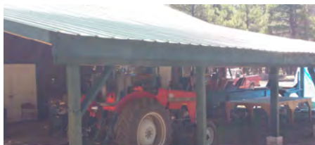
This lean-to was expanded to use as an open-air auditorium this summer and future storage.

While we now know that we will not complete the water system or sanitation by summer, we do want the electrical work to be done. As I write this, we have an outstanding need