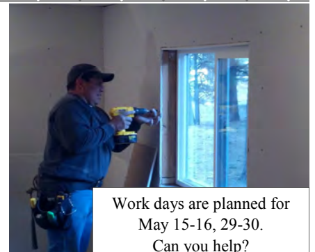
Work days are planned for May 15-16, 29-30. Can you help?

of $12,650. We have enough to get going, but we need the Lord's provision for the rest by June. We also have found the need to purchase a mobile commercial kitchen. Matching funds up to $20,000 have already been promised for this $43,000 item which can be built in six weeks. This will allow us to fulfill county health department requirements for the next several years. Once we have a permanent kitchen, we can either sell this unit or use it as a concessions location.