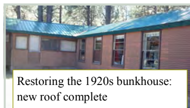
Restoring the 1920s bunkhouse: new roof complete

Phase one of the bunkhouse renovation is nearly complete. We are restoring the 1920s building on site in order to continue housing work groups and to make it suitable for future summer staff housing.