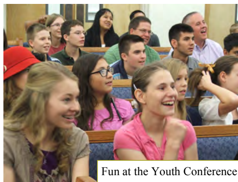
Fun at the Youth Conference

We appreciate your prayers and your involvement in this ministry. Please continue to pray that the Lord opens the doors we need for effective ministry and development progress here at home in the West.