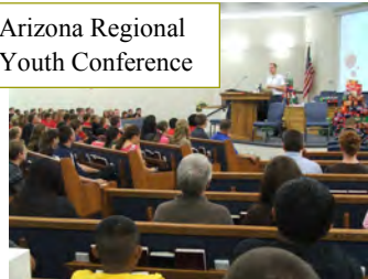
Arizona Regional Youth Conference

for the past three years. We had nearly two hundred in attendance with one teenage girl saved and many other decisions made for the Lord.