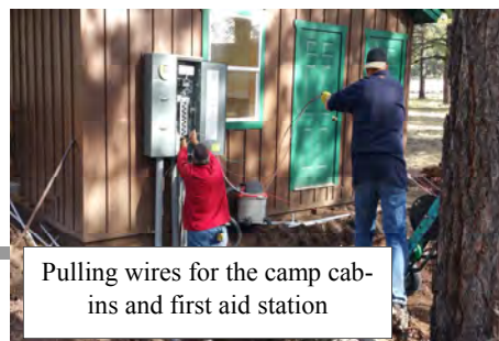
Pulling wires for the camp cabins and first aid station