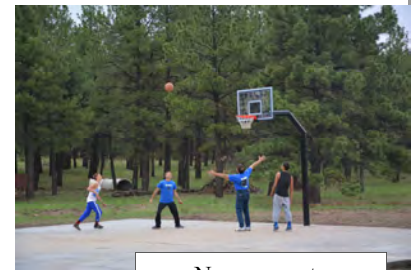
New concrete basketball court in use during Youth Camp