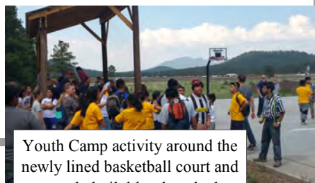
Youth Camp activity around the newly lined basketball court and recently built bleacher shade

edged out another former champ, Tohono O'odham Baptist of Casa Grande. Open Door won a free retreat at West Branch, and the other winners will receive mountains of goodies to be distributed at our upcoming Youth Conference in Peoria.