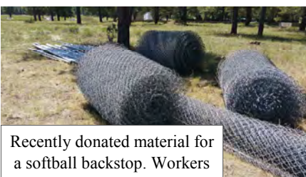
Recently donated material for a softball backstop. Workers needed for installation.

require as much involvement from state departments as was recently expected. We have employed an engineer to draw up the official plans so that we can get an accurate cost estimate. We already have a contractor that is willing to put the