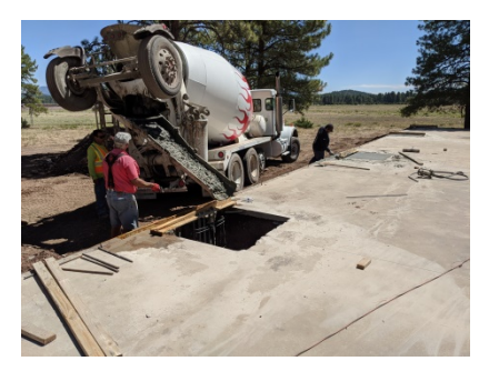
Concrete Piers for Steel Pillars

We have been given the indication by our local building department that we can occupy this building for meeting space once this phase is completed. We will deal with additional utilities and the kitchen later on. The work is being done by local contractors with a Christian contractor overseeing the project. Once we near the end of this phase, we will need additional help moving on to the next phase. While a single donor is covering the cost of getting this building up and usable, we are still